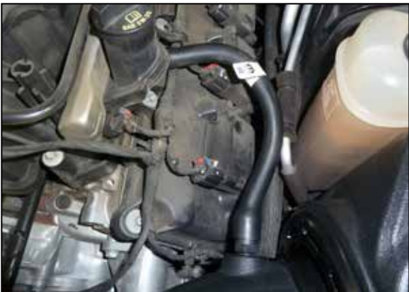
17. On all models, the factory CCV hose will connect to the fitting on intake tube. Note: 2020 and up models, the factory CCV hose will stretch on to the fitting.