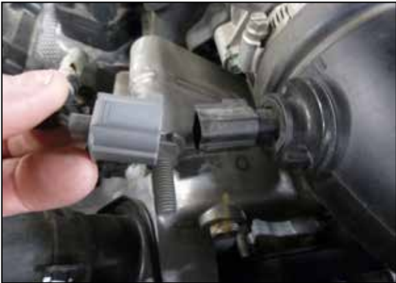
3. Disconnect the IAT sensor electrical connection.