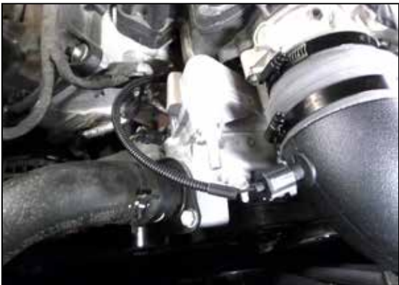
18. Using the provided extension harness, reconnect the IAT electrical connection.