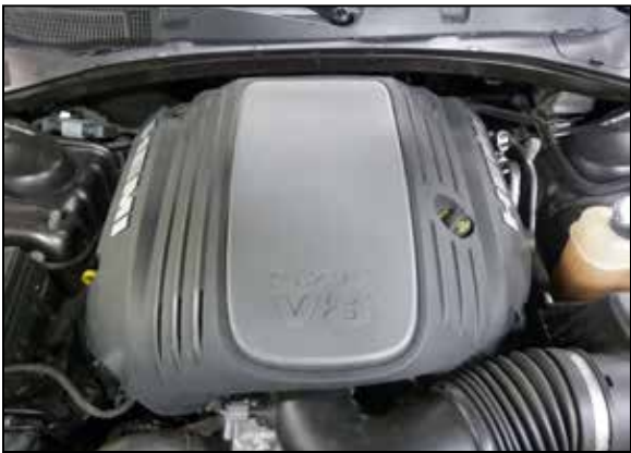
2. Lift the engine cover up and remove it from the vehicle.