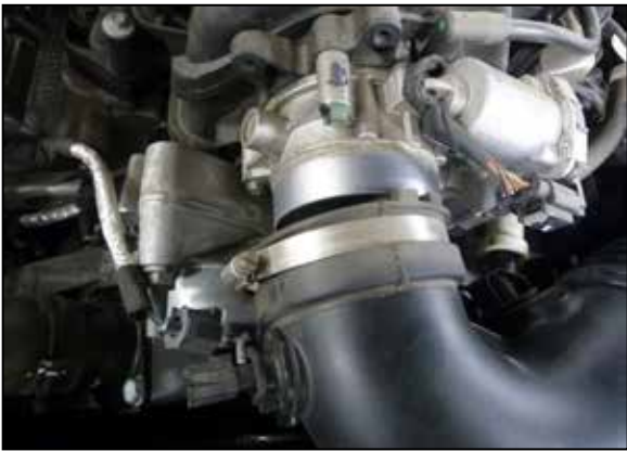
4. Loosen the hose clamp that secures the factory intake tube to the throttle body and separate the tube from the throttle body.