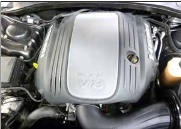
19. Reinstall the factory engine cover.