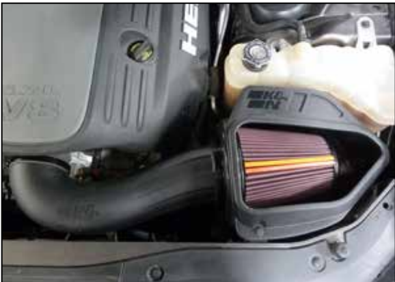
20. Reconnect the vehicle's negative battery cable. Double check to make sure everything is tight and properly positioned before starting the vehicle.

21. It will be necessary for all K&N® high flow intake systems to be checked periodically for realignment, clearance and tightening of all connections. Failure to follow the above instructions or proper maintenance may void warranty.