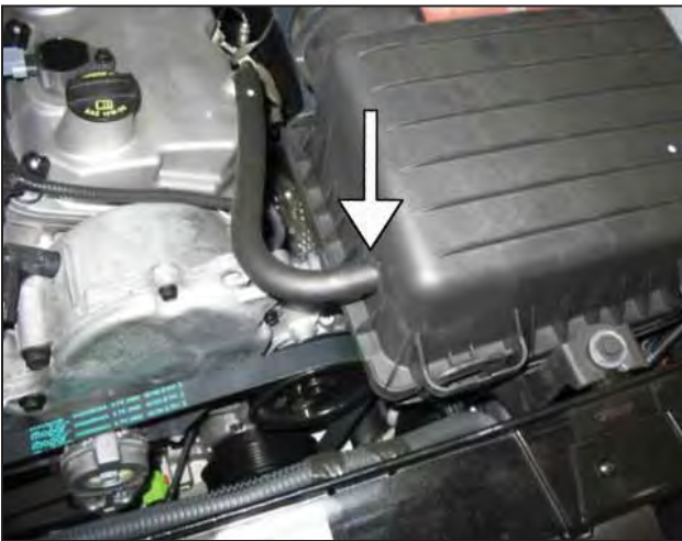
c. Remove the PCV breather tube from the air box.