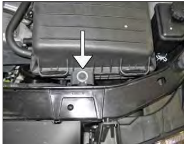
d. Loosen and remove the air box mounting screw. This screw will be reused.