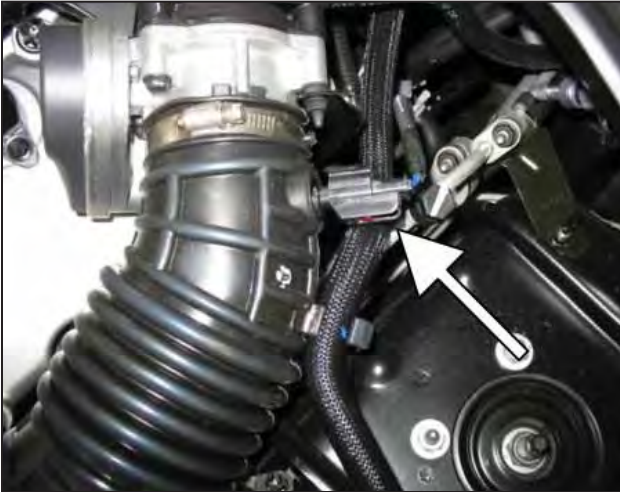
a. Disconnect the inlet air temperature (IAT) sensor connector.