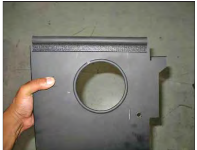
c. Attach the foam gasket onto the top of the heat shield.