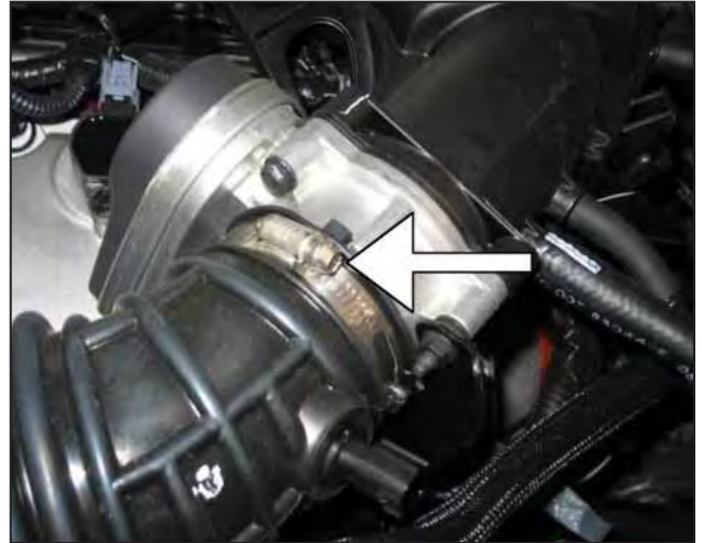
b. Loosen hose clamp at the throttle body.