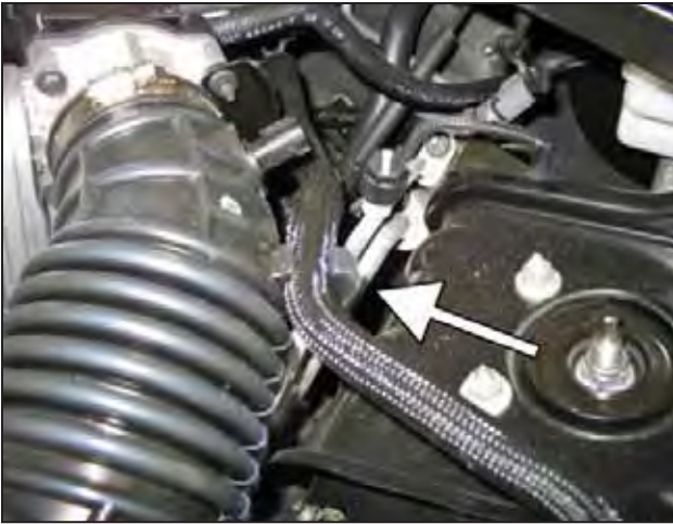
e. Remove the coolant line from the air tube.