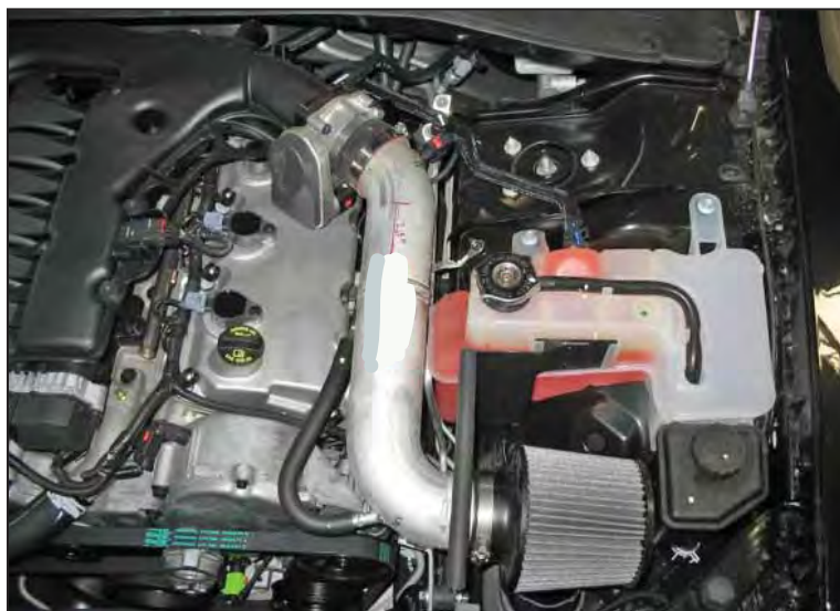
intake system installed

m. Insert the grommet for the IAT sensor into the intake pipe. Insert the IAT sensor and reattach the IAT sensor harness connector that was disconnected in step 2a. Secure the intake pipe to the throttle body coupler.