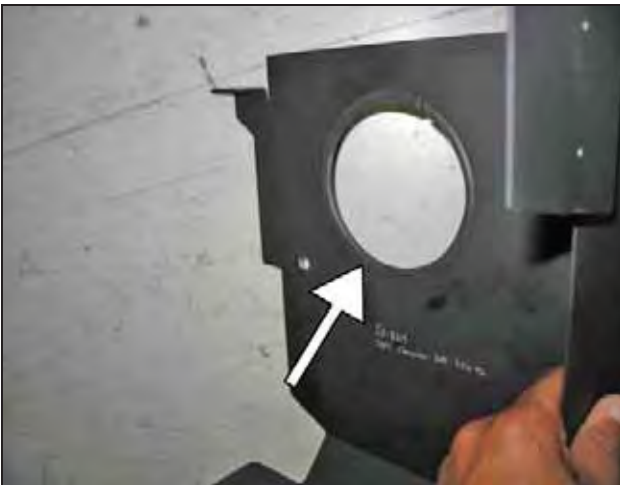
b. Attach the rubber edge trim to the intake pipe opening on the heat shield.