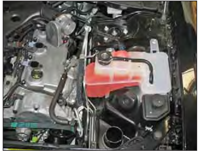
f. Remove the air box assembly from the engine bay.