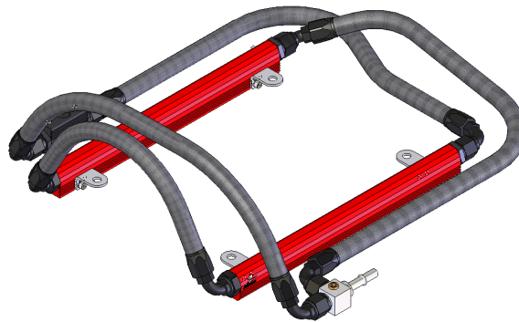
Example of “returnless” fuel system plumbing