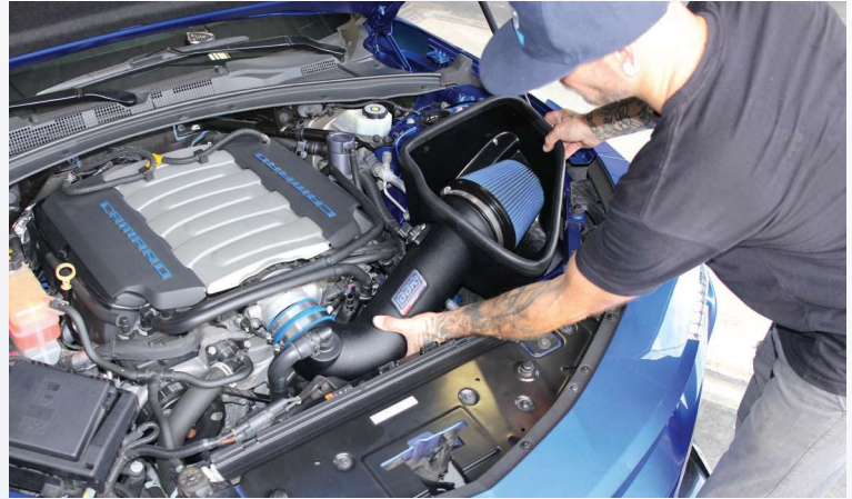
Now its time to install the complete BBK Cold air assembly onto the vehicle