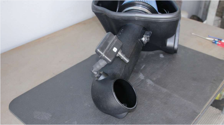
See photo to double check correct installation of vacuum box.