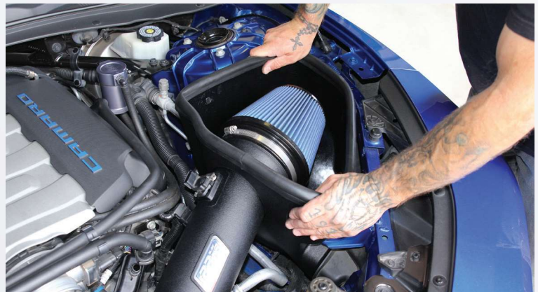
Start by positioning the assembly as shown in photo 27 – Now locate the metal locaters pins on the BBK airbox and locate the Black OEM grommets – when in position over each other – push down to engage and snap into position – locate the factory air inlet tube in the lower corner of the fender well and massage into position over the BBK airbox to allow the flow of cold air directly into the BBK airbox.