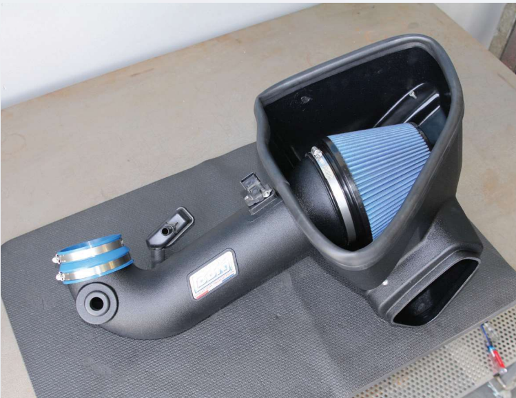
Install the Blue BBK Silicone coupler and clamps as shown – this photo now shows the correct installation of all parts onto the BBK cold air kit.