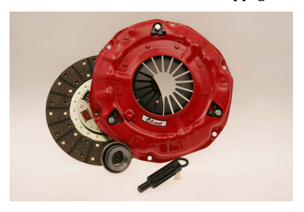
Street Pro #75121 Shown