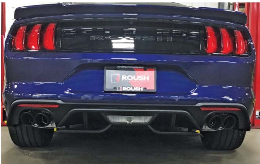
Plastic Rear Valance Diffuser

P/N: 422085 (1318-17F954), P/N: 422125 (R1318-CF17F954)