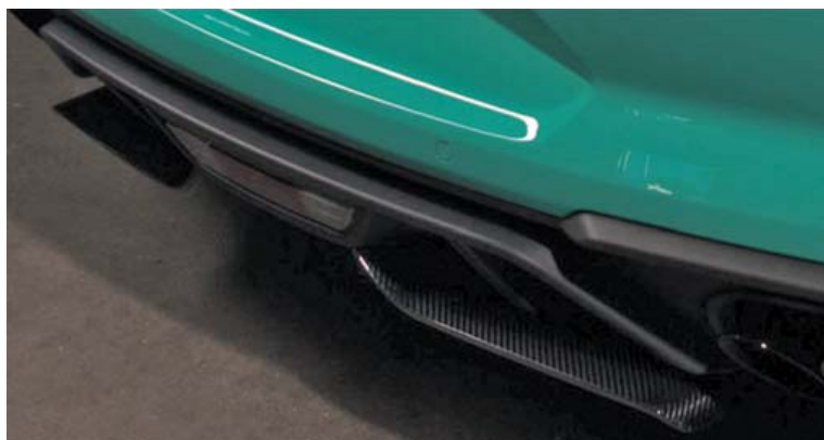
Carbon Fiber Rear Valance Diffuser

Application: 2018 Ford Mustang GT (5.0L V8 Coyote)