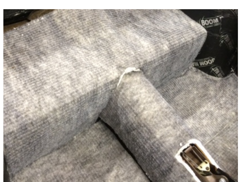
UC Lite installed with gray side up.