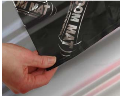
3. Carefully apply to clean and dry area.