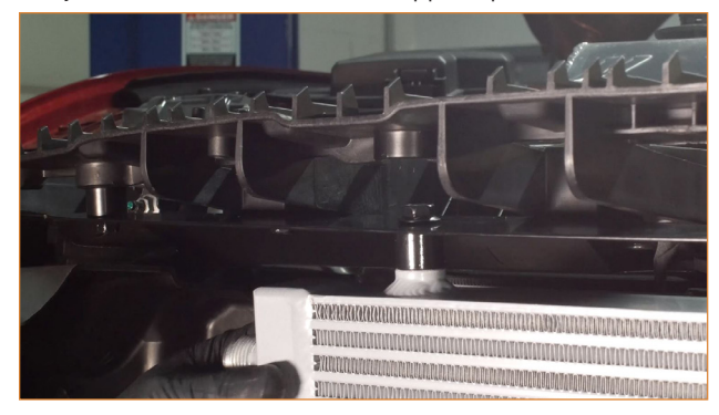
CONTINUED ON FOLLOWING PAGE