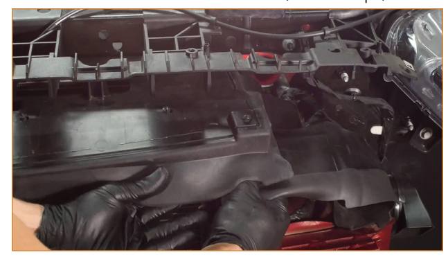
CONTINUED ON FOLLOWING PAGE

33. Push downward on the lower air diverter to release the six tree-clips that secure it. Once the air diverter is loose, push both radiator ducts inward, and slip the air diverter out to remove it from the vehicle. (6x tree-clips)